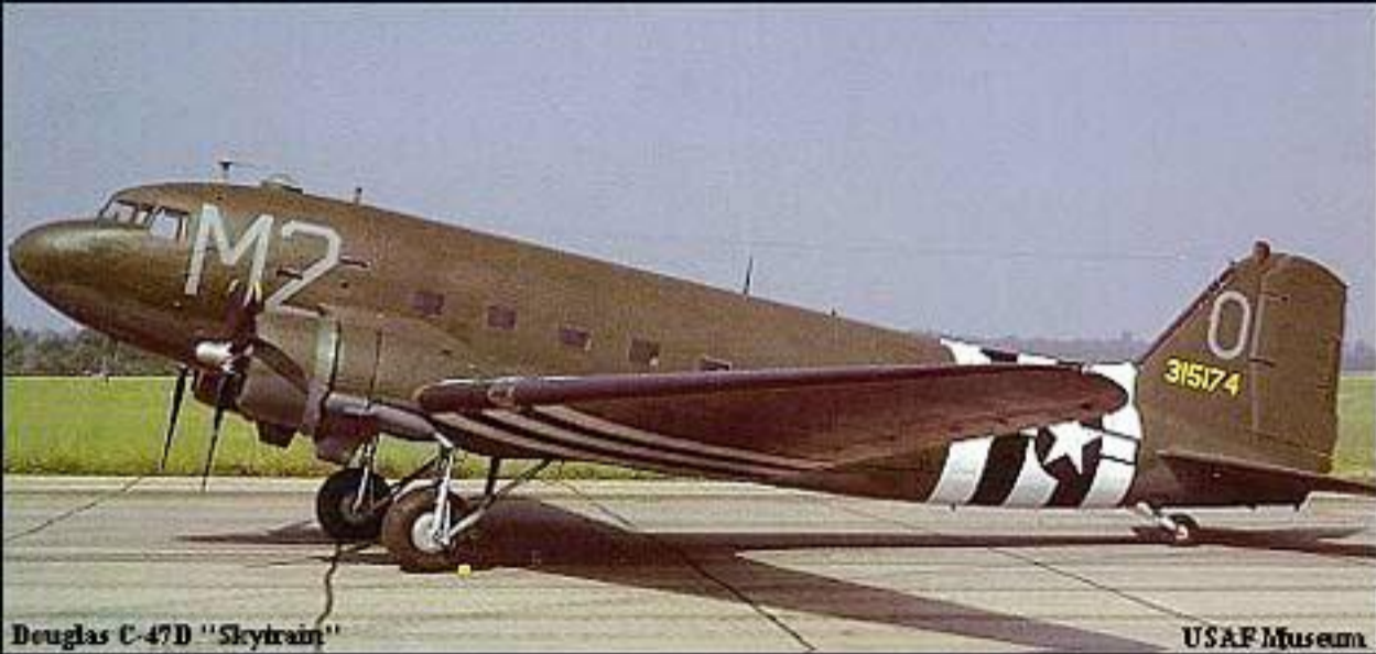
Douglas C-47D "Skytrain"