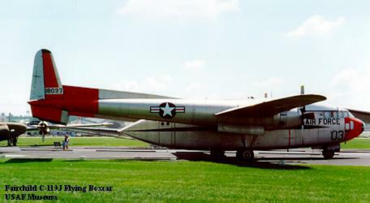
Fairchild C-119J Flying Boxcar USAF Museum