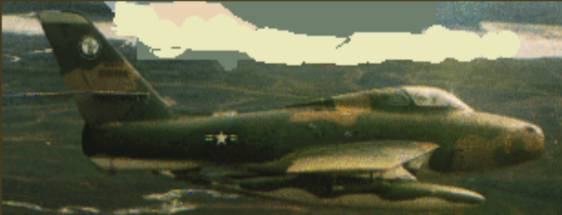
Portuguese owned F84 Thunderjet