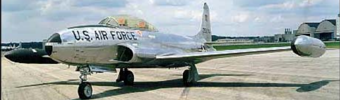
Lockheed T-33A "Shooting Star" USAF Museum