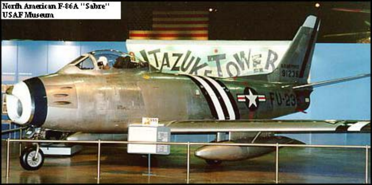
North American F-86A "Sabre" USAF Museum