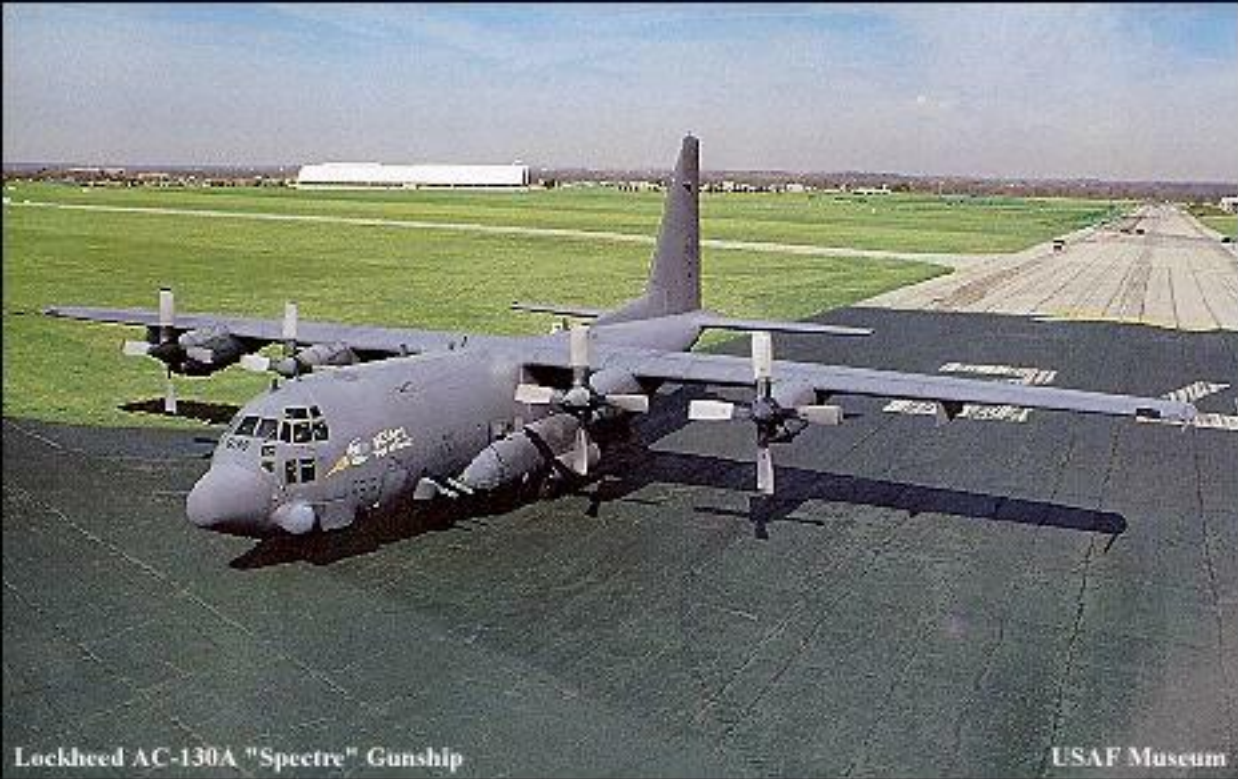
Lockheed AC-130A "Spectre" Gunship