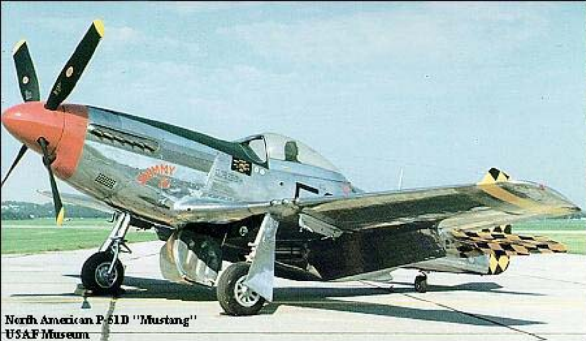
North American P-51D "Mustang" USAF Museum