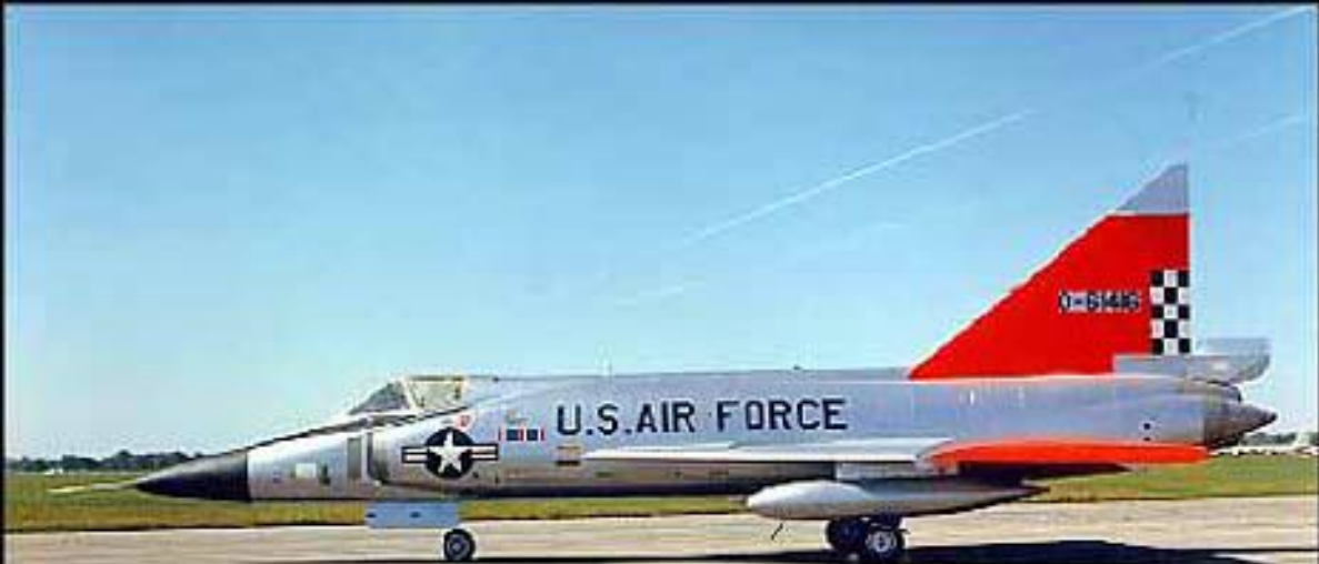
Convair F-102A "Delta Dagger"